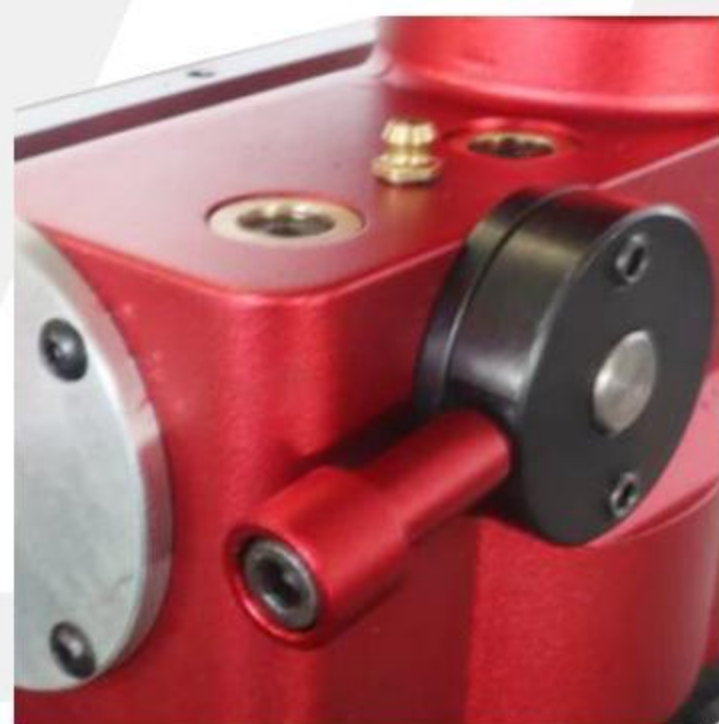
快 / 慢档 Fast/slow