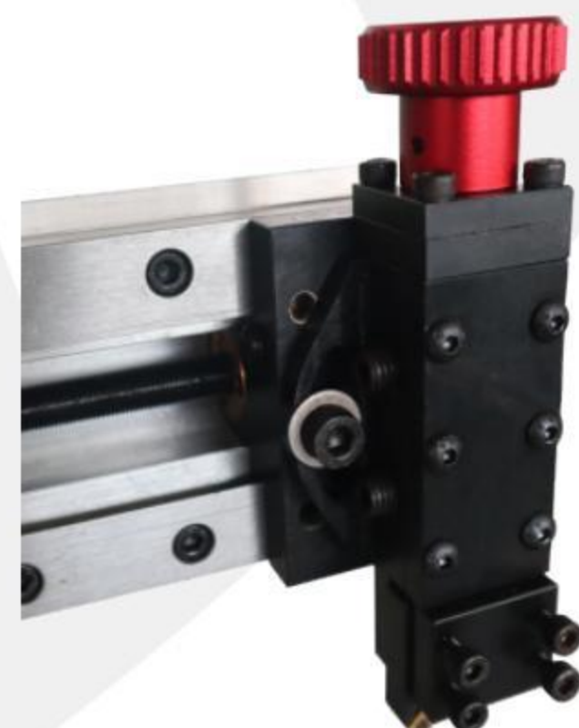
轴向进刀调节手柄 Axial Feed the Regulating Handle